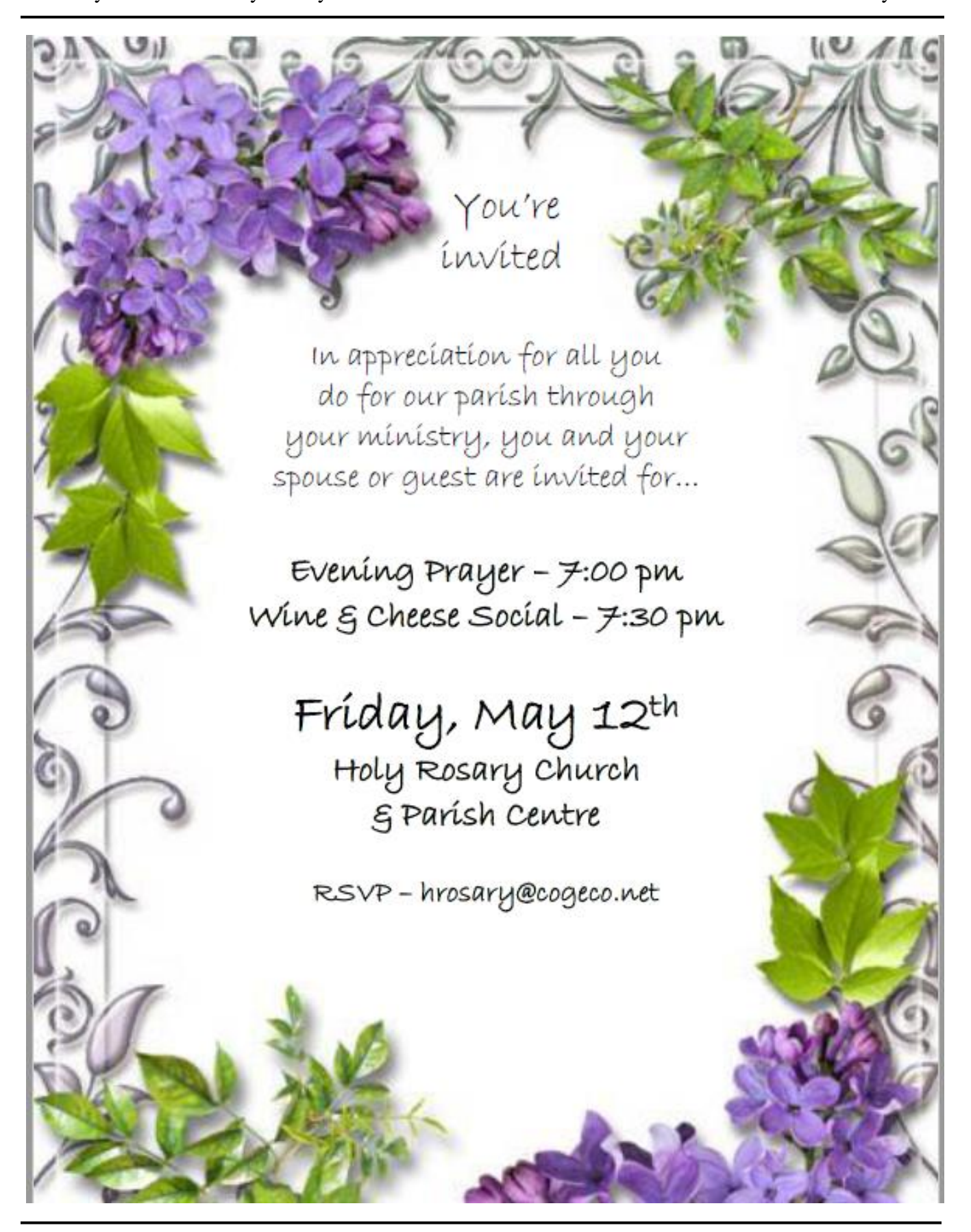
~ 10 ~ 287 Plains Road East, Burlington, Ontario L7T 2C7